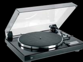
Piano laquer silver finish

Dimensions/Weight: 440 x 119 x 360 mm / 7.8 kg