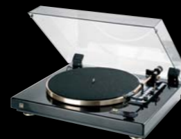
Piano laquer gold finish